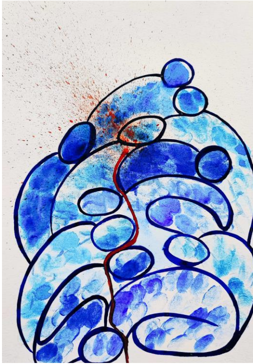
Maryna Kaminska Unidentified , 2022, 21x30 cm, watercolour, paper

series. Created amid her forced migration as a result of the war, they demonstrate the ferocity of the war's destructive force and how it decimates the lives of people, both physically and psychologically.