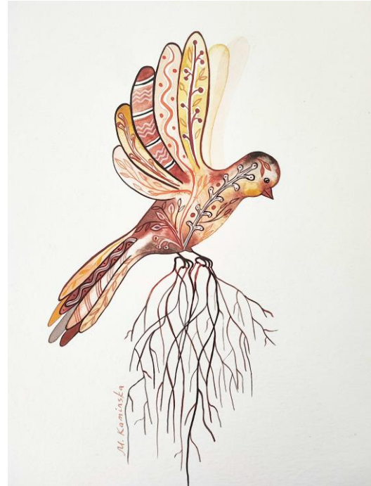
Maryna Kaminska Forced Migration , 2024, 30x40 cm, watercolour, paper

Juxtaposed with the blue palette paintings in the series are ones, which are predominantly yellow. They reflect the richness of Ukrainian culture, its symbols of strength and light. Earth tones are also utilized. Chris Connolly found himself drawn to Kalyna-Malyna . Elaborately designed, the watercolour on paper painting features the outline of a woman with hair split in the middle. Atop her head lies a panoply of viburnum. “Heaven and earth are construed in this painting by its dream-like quality. The blooming of the viburnum symbolizes resilience and possibility.”