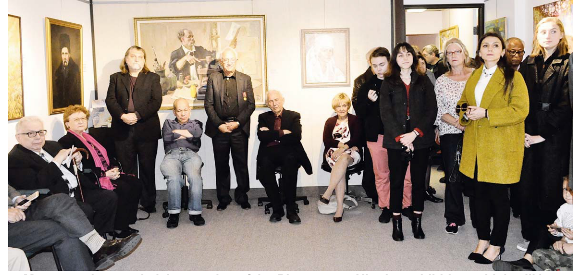
Many people attended the opening of the Picturesque Ukraine exhibition, which will be on display to December 20, including a representative of the Consulate of Ukraine in Toronto. After the museum is relocated in 2019, events like this will be more comfortably accommodated.

Rare excitement filled the air on October 14 when the Taras H. Shevchenko Museum unveiled the exhibition Picturesque Ukraine . After all, it is not often that lovers of art in Canada can view 49 works by over 40 contemporary Ukrainian artists, all gathered in one place.