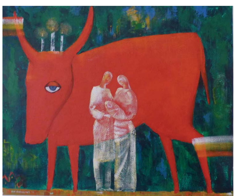
This painting became the symbol of the exhibition, appearing on promotional material and advertizing.