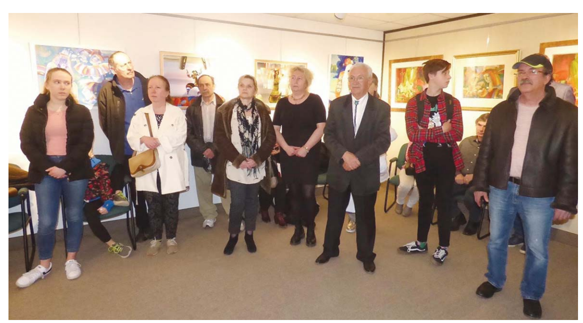
The opening formalities took place in the second-floor gallery.