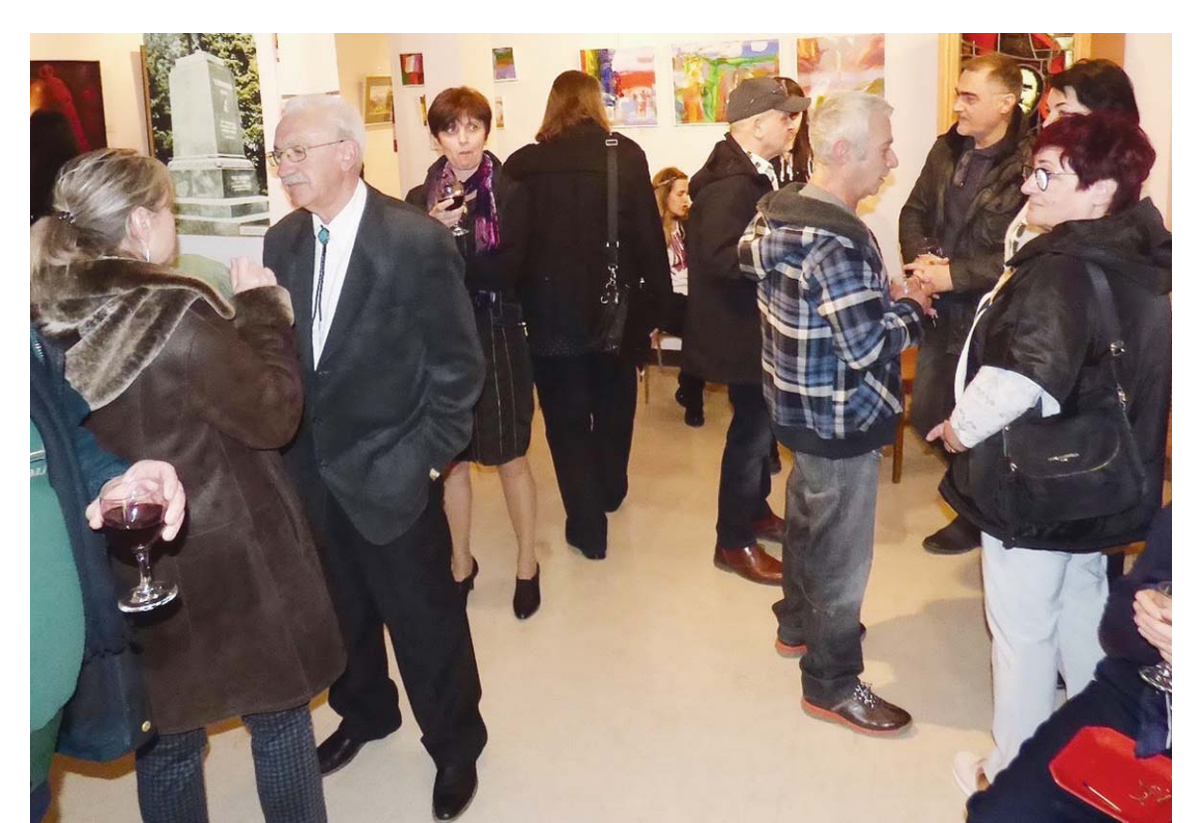
Wine and cheese, with fruit and berries, were served on the street level, where more art was on display.